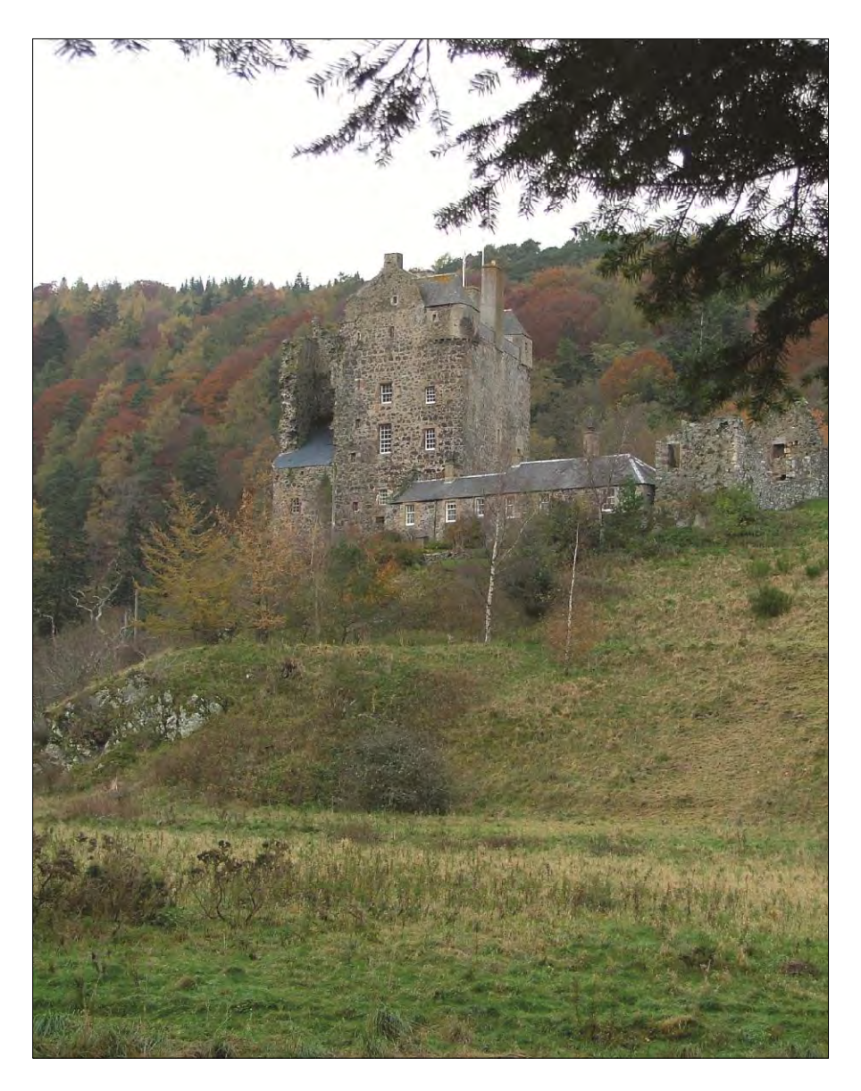
Neidpath Castle Its rocks and grassland are home to scarce plants