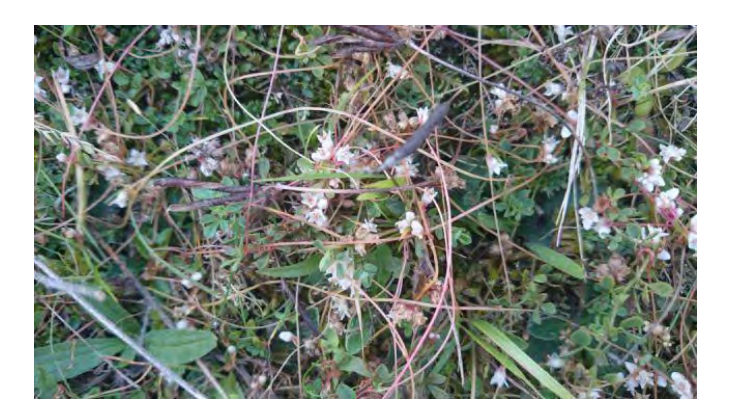
Photo 1. Cuscuta epithymum from Hassop Common September 2014

Cuscuta epithymum (Dodder) The first record for this for over 100 years was sent in recently by Peter Tattersfield from Hassop Common (SK2273) September 2014 on Lotus . He thought it might have been introduced with habitat restoration of old mineral workings, presumably casual.