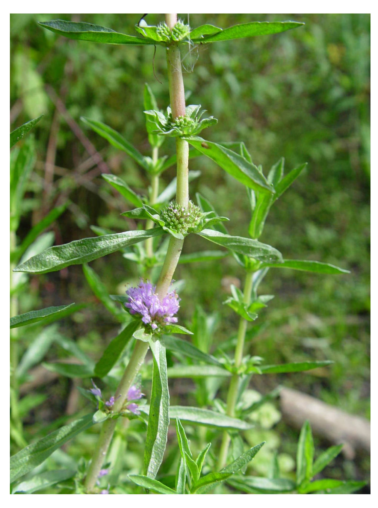
Mentha cervina, Chorlton, near Nantwich.