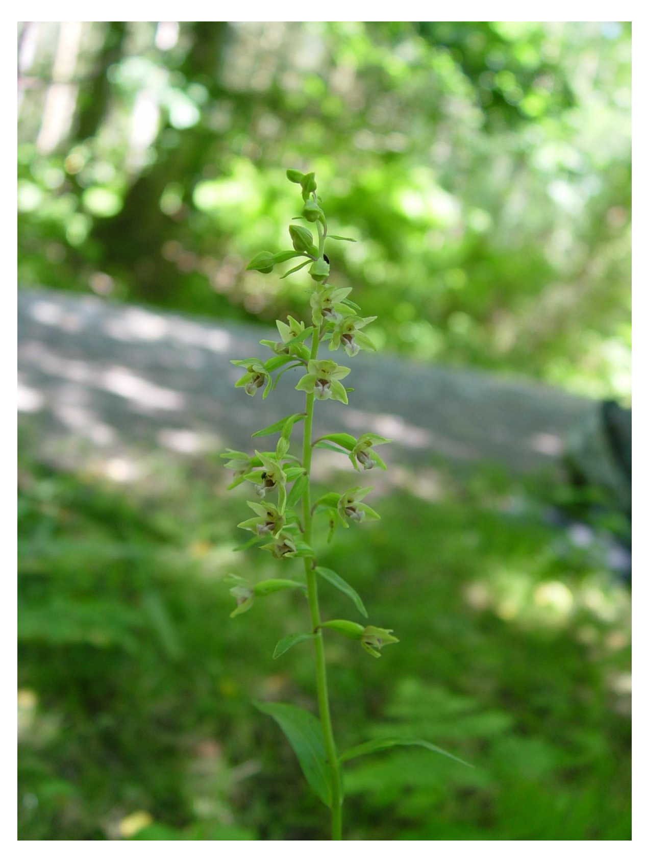
Epipactis dunensis by Blakemere.