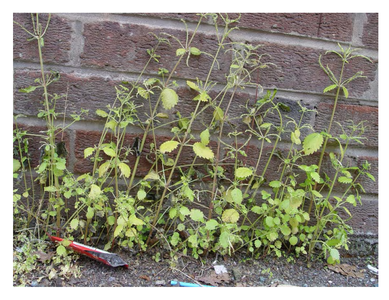
Urtica membranacea, Pensby, Wirral.