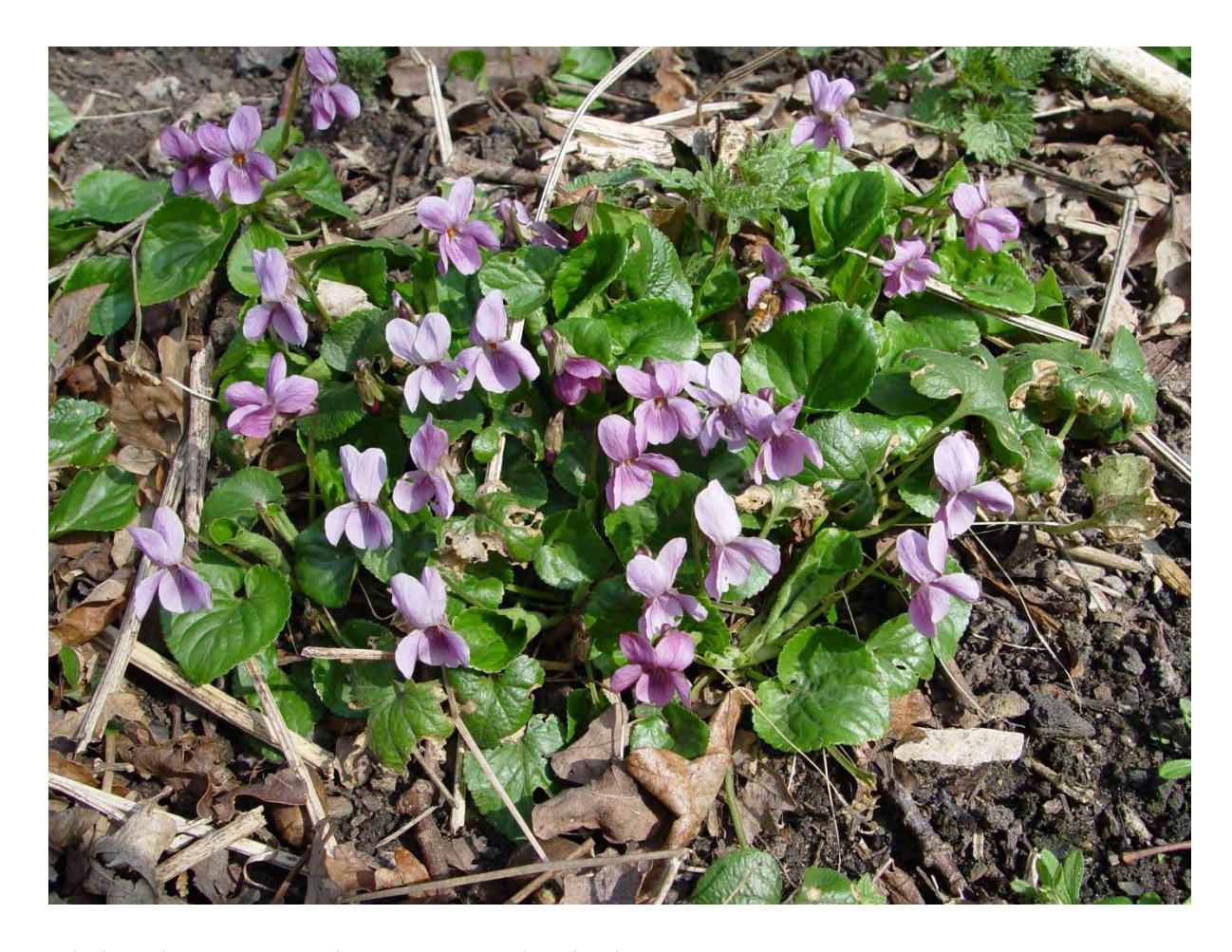
Viola odorata var subcarnea at Wheelock.