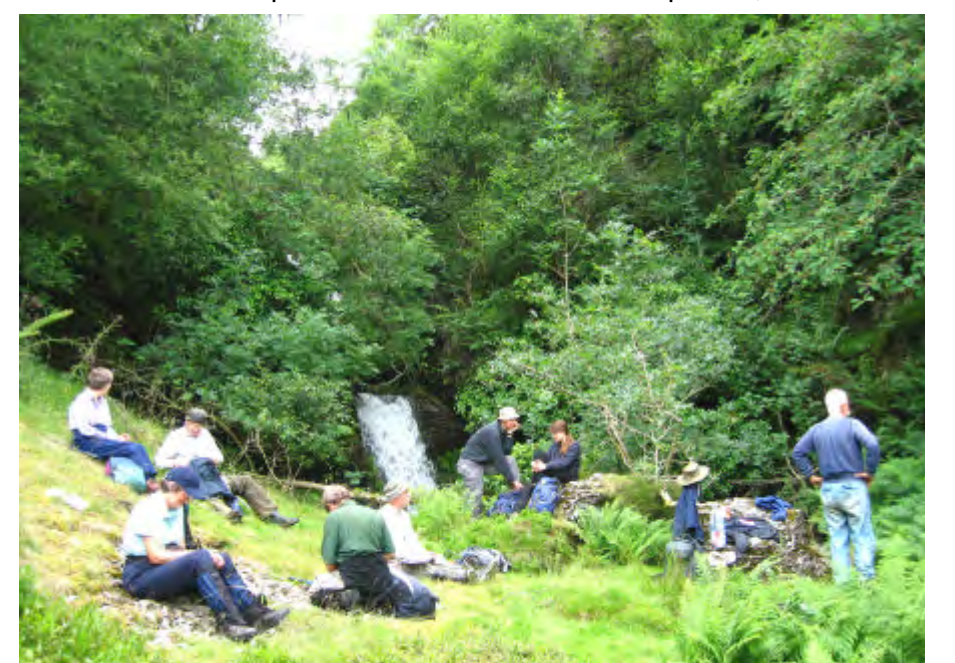
Lunch by the Merchon lower waterfall.

We have booked next years' Glynhir week from Saturday 9<sup>th</sup> July to Saturday 16<sup>th</sup> July 2011 and hope that it will take-on a similar format to this year's meeting. This fits in between the National BSBI AGM in Galway around 18<sup>th</sup> and 19<sup>th</sup> June and the Welsh AGM at Dale Fort, Pembrokeshire on 12<sup>th</sup> to 14<sup>th</sup> August. We hope you will be able to attend. The meeting will be advertised in BSBI publications in due course but please, in the mean time, feel free to let us know