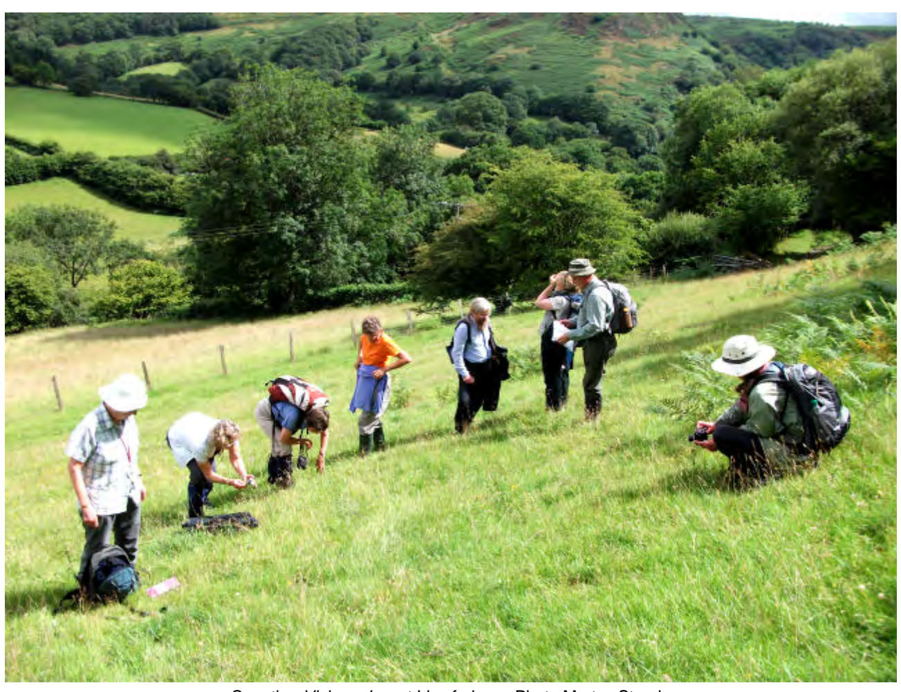
Counting Vicia orobus at Llys-fedw.