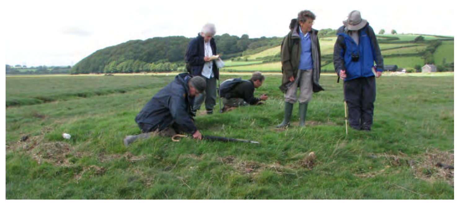
Examining Hordeum secalinum (Meadow Barley) in an attempt to refind Hordeum marinum (Sea Barley) for the BSBI Threatened Plants Project, Mwche, Llanybri (SN3211).