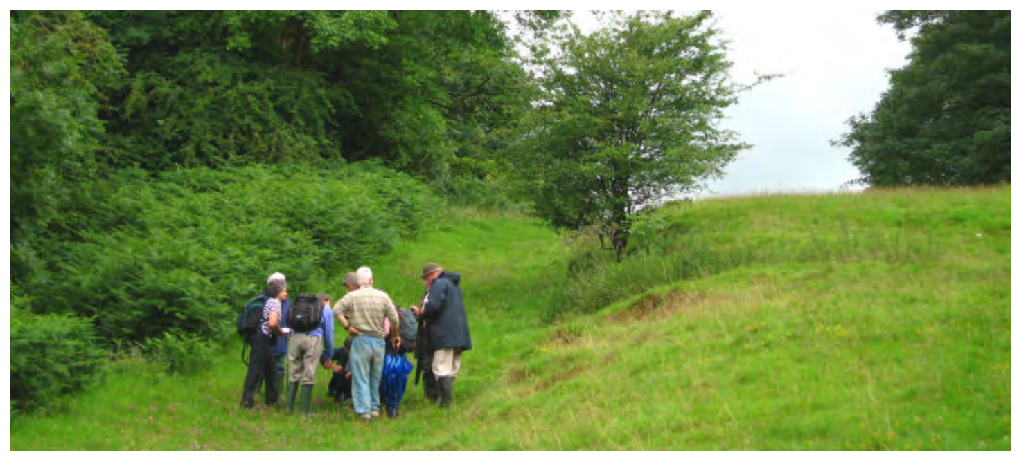
Examining Carex spicata (Spiked Sedge) during the walk from Glynhir on Friday afternoon.