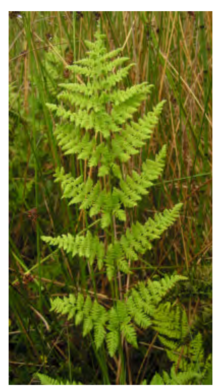
Above Left: Nant-y-Mwyn leadmine, Rhandirmwyn (SN7844), last worked in the 1930s, Above Right: Dryopteris carthusiana (Narrow Buckler-fern), Below Left: Silene uniflora (Sea Campion), Below Right Huperzia selago (Fir Clubmoss), all on the lead-mining spoil at Nant-y-mwyn.