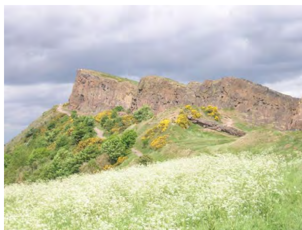
Salisbury Crags in a moody sky, Holyrood Park (Arthur's Seat Volcano SSSI)