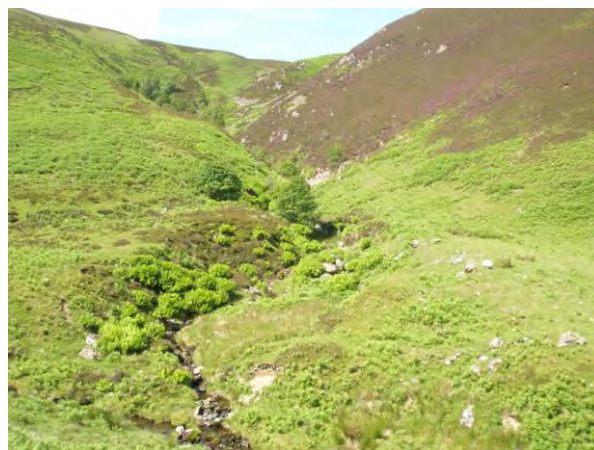
Hawkster Gill Burn, Moorfoot Hills (edge of Dundreich Plateau SSSI)