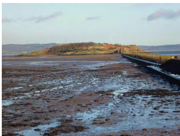
Cramond Island at low tide, approached by a causeway

Abbreviations: approx., approximately; RP, Regional Park; SAC, Special Area of Conservation; SSSI, Site of Special Scientific Interest; SWT, Scottish Wildlife Trust.