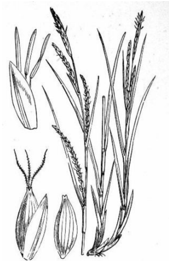
1152. Carex strigosa Huds. Thin-spiked Sedge.