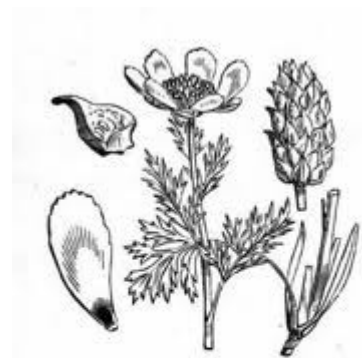
7. Adonis annua L. A. autumnalis L. Pheasant's Eye ; R.

Pheasant's-eye ( Adonis annua ) Ken Balkow discovered this as a casual in the area of new canal extension at Staveley in September (SK4375) growing in newly disturbed and restored ground. With its beautiful red flower, this plant has in the past been a weed of cultivated ground locally but has not been seen since at least 1950 in the county.